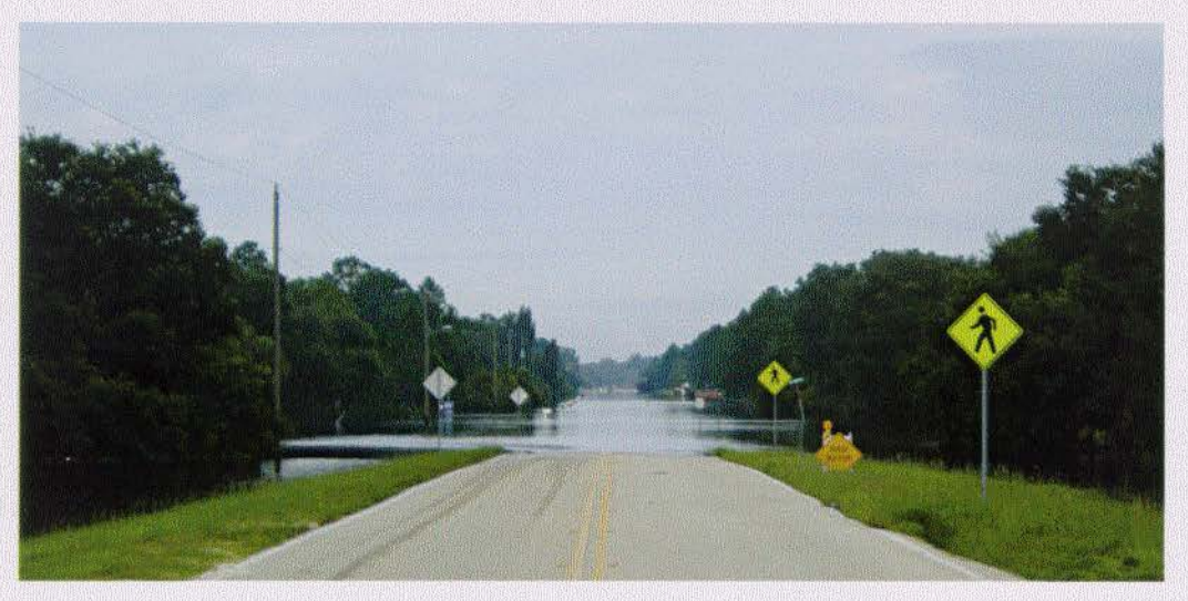
Figure 5—View of road overflow at discharge of 4,450 ft<sup>3</sup>/s, Big Slough Canal at Tropicaire Boulevard near North Port (site 8, fig. 1, table 1) on June 24, 2003.

Additional information about water resources in Florida is available on the internet at http://fl.water.usgs.gov.