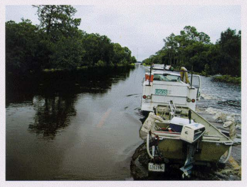
Figure 3—View of road overflow at discharge of 9,900 ft<sup>3</sup>/s in Horse Creek near Arcadia (site 2, fig. 1, table 1) on June 23, 2003.