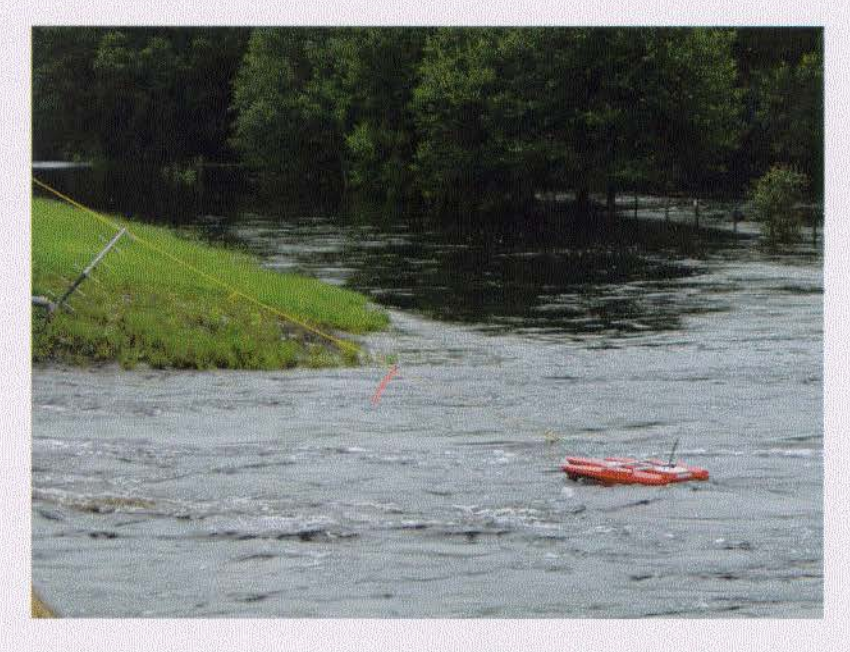
Figure 4 —View of Big Slough Canal near Myakka City (site 7, fig. 1, table 1). Discharge measurement being made using a tethered boat and acoustic doppler current profiler.

Kane, R.L., and Fletcher, W.L., 2002, Water resources data, Florida, water year 2002, Volume 3A. Southwest Florida Surface Water: U.S. Geological Survey Water-Data Report FL-02-3A.